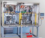
Assembly Stations for "Shock Tower"