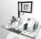
Measurement Fixture for "Shock Tower"